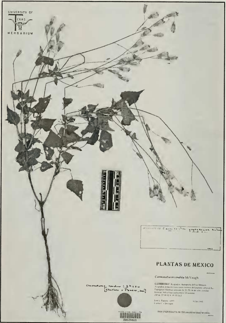
Fig. 1. Carminatia papagayana , holotype.